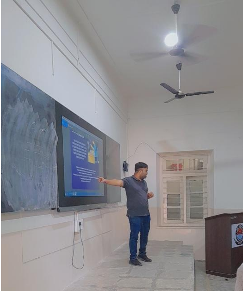
TRAINER PRESENT IN SEMINAR